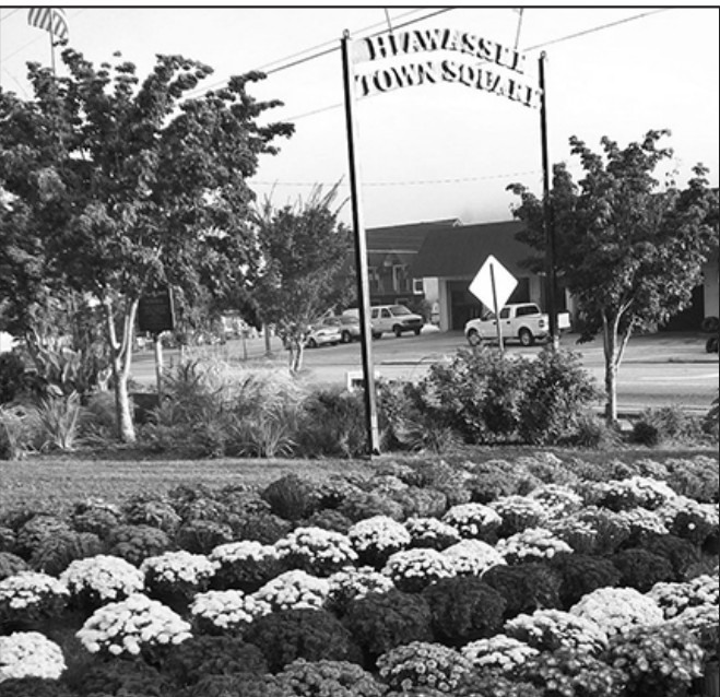
PUP has been selling mums on the square for many years, getting our last donations before winter. Thank you for your donations.

Fall is in the air and it's time to do your outside Fall Decorating! Operation PUP (Prevent Unwanted Pets) will be on the square in Hiawassee on Friday and Saturday, September 10-11, 2021 from 9 a.m.- 2 p.m. We will be on the corner of the square by the traffic light at Hwy. 76 and River Street.