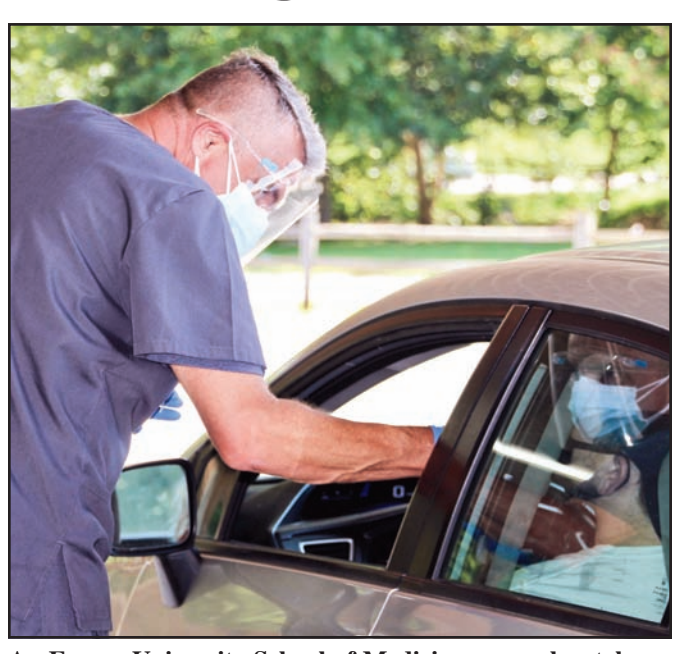
An Emory University School of Medicine researcher takes a nasal swab for COVID-19 testing at last week's drive-thru event in Blairsville.

These 600-plus people joined the more than 7,500 Georgians who have participated in the RADx-Tech research.