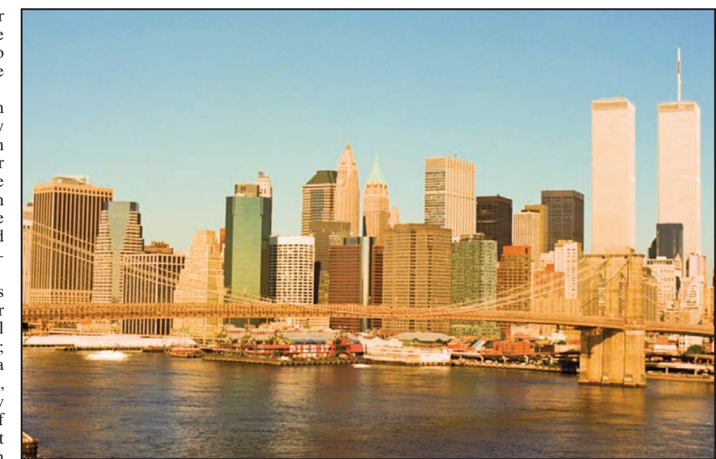
This photograph by David Monderer captures Lower Manhattan around 8:30 a.m. on Sept. 11, 2001 – about 16 minutes before a plane hijacked by al-Qaida terrorists struck the North Tower of the World Trade Center. Photo/911memorial.org