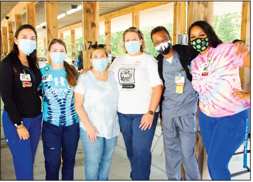
Nurses and researchers from Children's Healthcare of Atlanta who worked to collect swabs from children for COVID-19 testing last week.